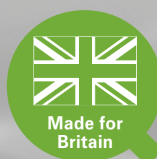
Made for Britain