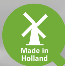
Made in Holland