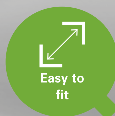
Easy to fit