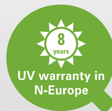
UV warranty in N-Europe