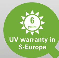
UV warranty in S-Europe