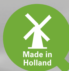
Made in Holland