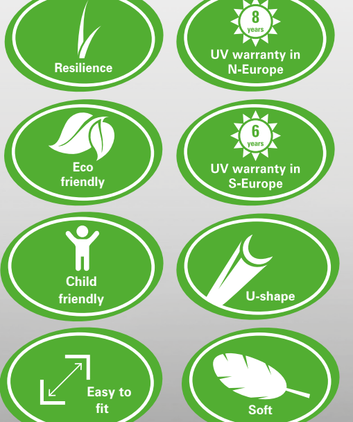
Made in Holland